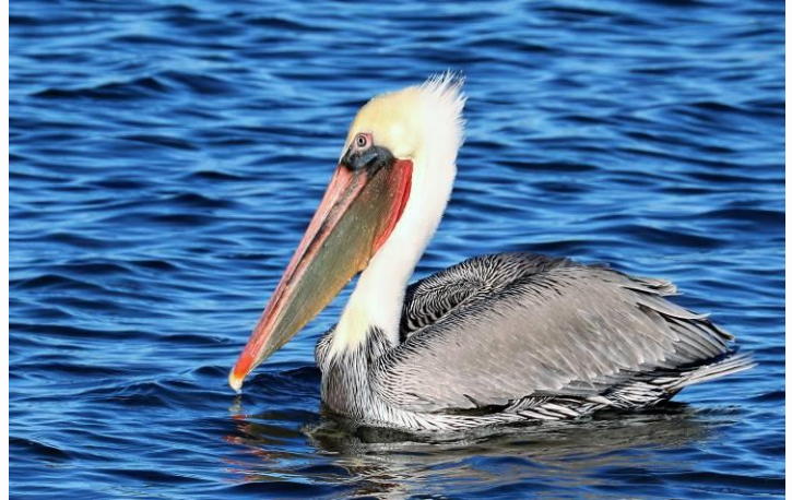
California Brown Pelican