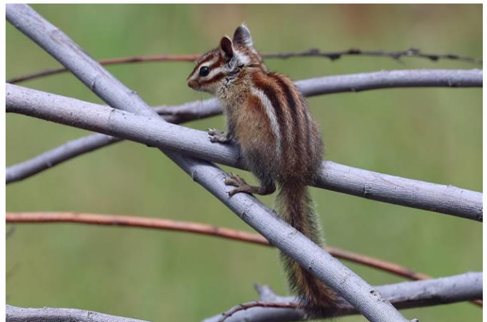
Sonoma Chipmunk Pine Flat Road