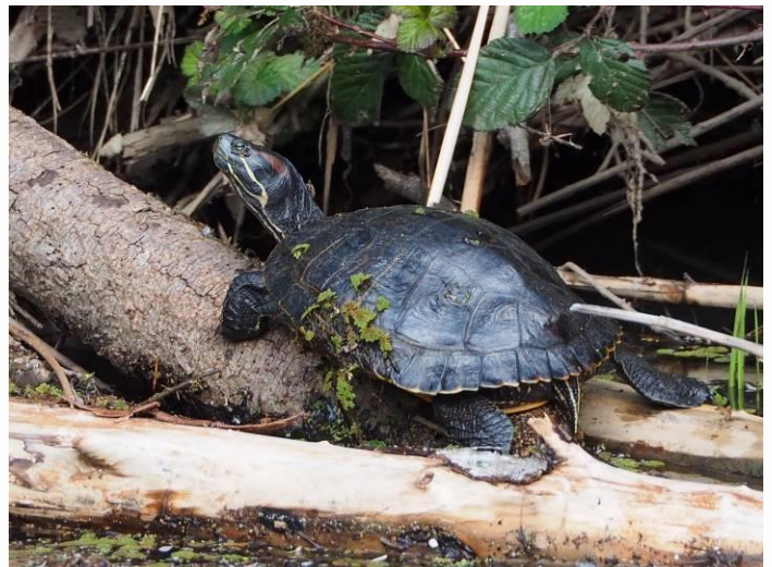
Wood Duck Family and Red-eared Slider