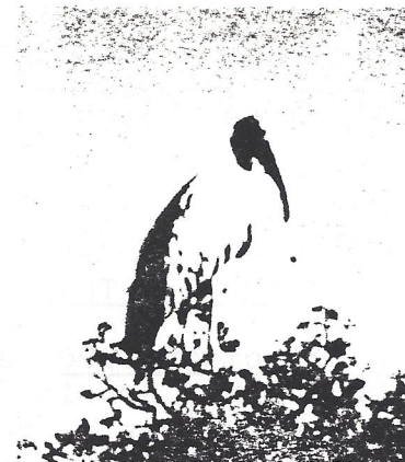
Wood Stork