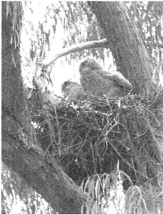
Owlets - on Easter at Spring Lake

RROS General Meeting Thursday, May 12th, 2011 6 p.m.