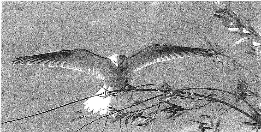
Juvenile Kite - Ellis Creek

RROS General Meeting October 13, 2011 at 7 p.m.