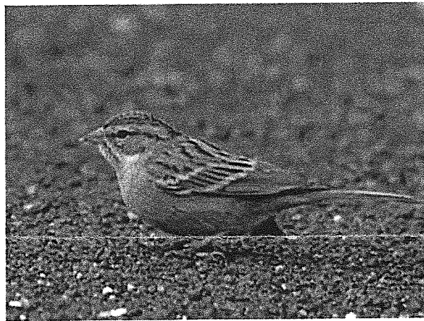
Chipping Sparrow, SR Christmas Count