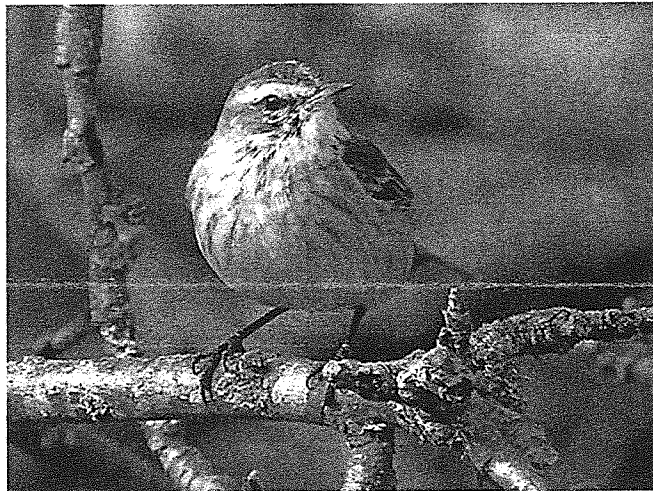
Palm Warbler Cypress Hill Memorial Park Petaluma

RROS General Meeting April 12, 2012 at 7 p.m.