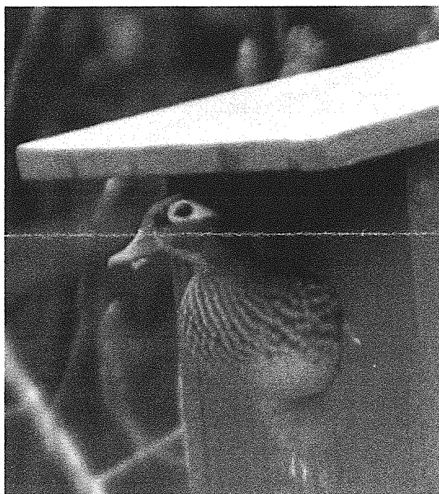
Wood Duck by Dennis See article page 4

RROS General Meeting May 10, 2012 at 6 p.m.