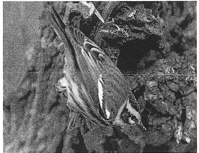
Townsend's Warbler, Spring Lake RP