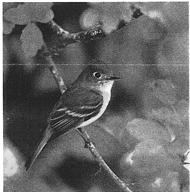
Pacific Slope Flycatcher