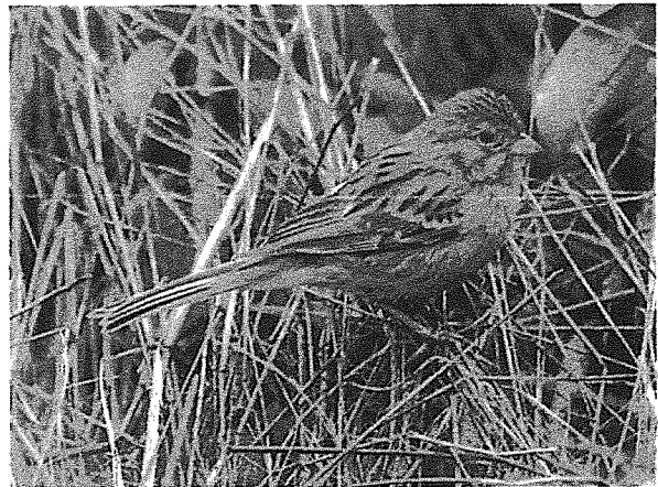
Brewer's Sparrow, at Shollenberger Park

From Hwy 101, take Hwy 116 west toward Sebastopol. Turn right (north) on Llano Rd. and go ~ 1 mile to Laguna Wastewater Treatment Plant at 4300 Llano Rd, Santa Rosa . Look for an open gate on right. Proceed to Administration Bldg. at SE corner of the plant. From Hwy 12, take Llano Rd. south about 3 miles. Plant is on the left.