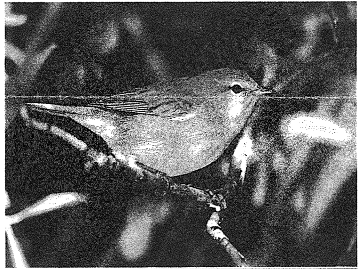
Orange-crowned Warbler