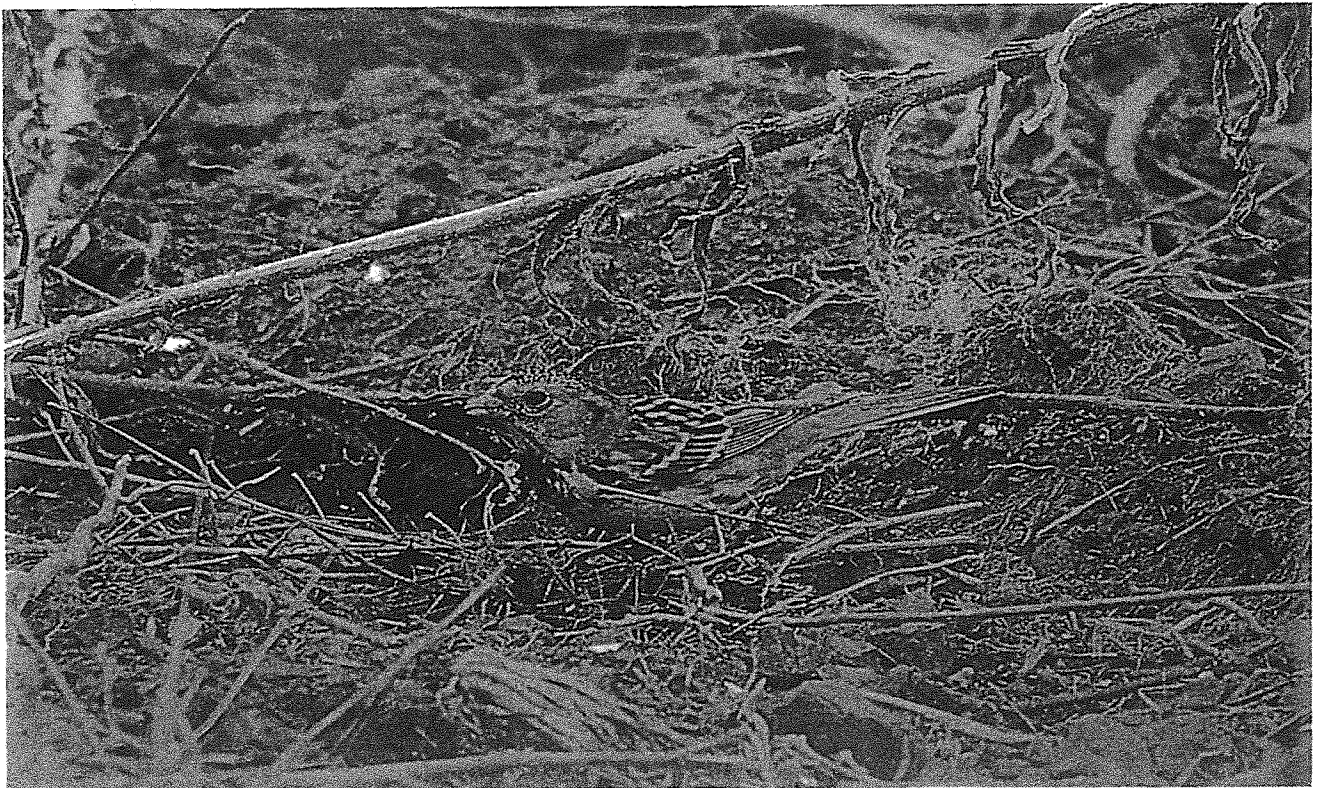
Harris's Sparrow, 1 st Winter, Bodega Bay Walk