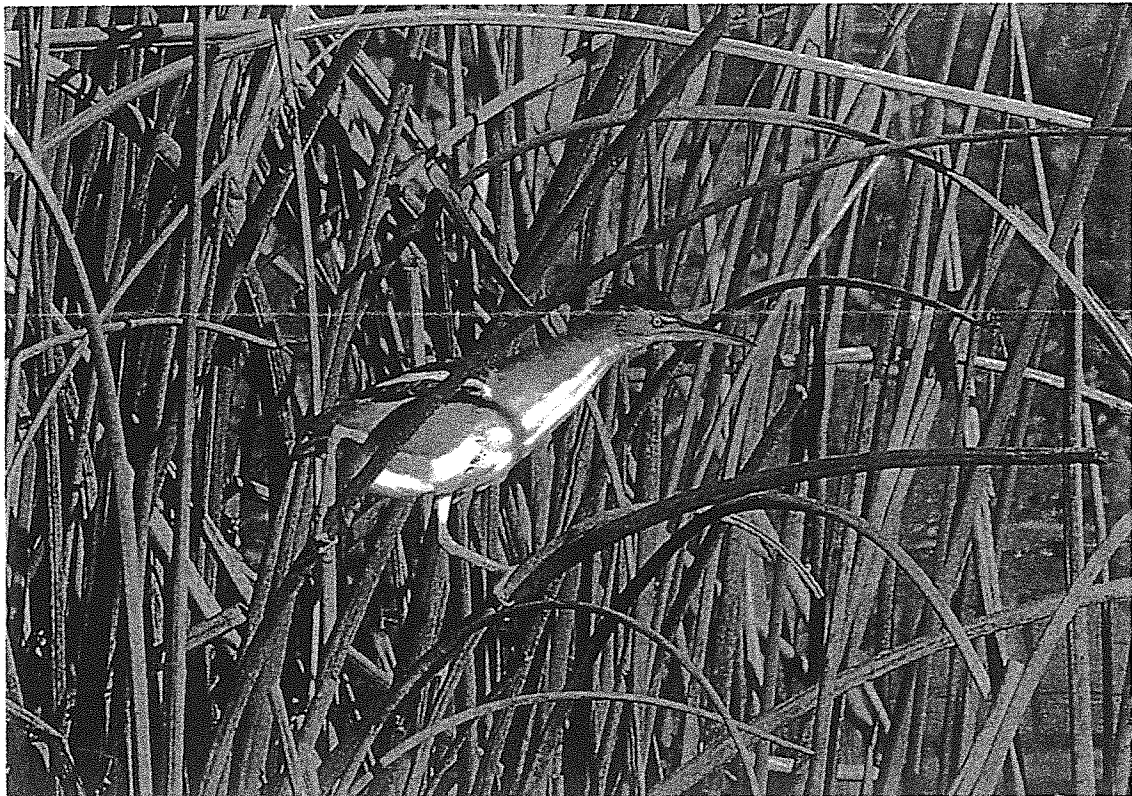
Least Bittern, Foothill Regional Park

RROS General Meeting, January 14, 2015 7p.m., First United Methodist Church 1551 Montgomery Ave., Santa Rosa, CA (NEW LOCATION)