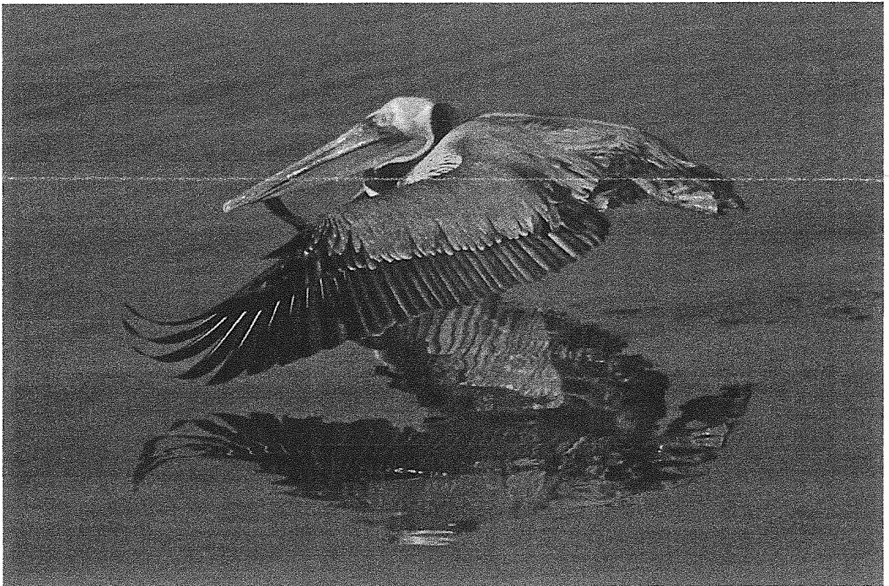
"Pure Grace", Bodega Harbor

RROS General Meeting, February 11, 2015 7p.m., First United Methodist Church 1551 Montgomery Ave., Santa Rosa, CA