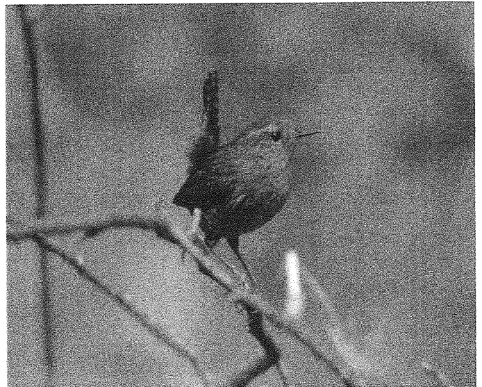
Pacific Wren, Sugarloaf SP