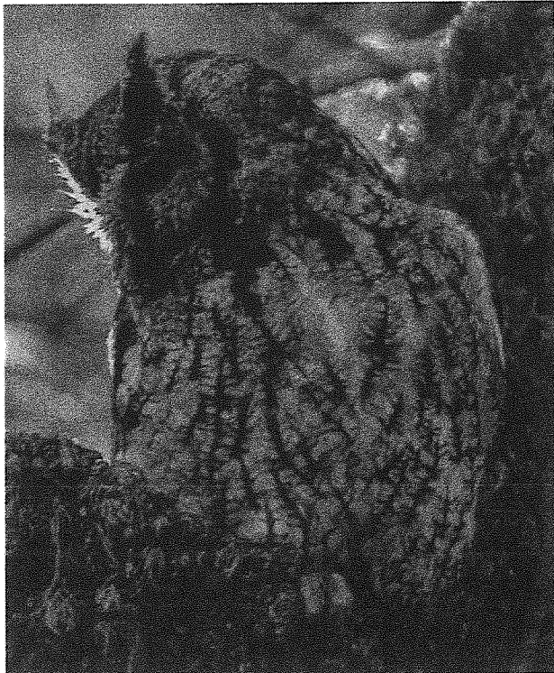
Western Screech Owl, Annadel SP