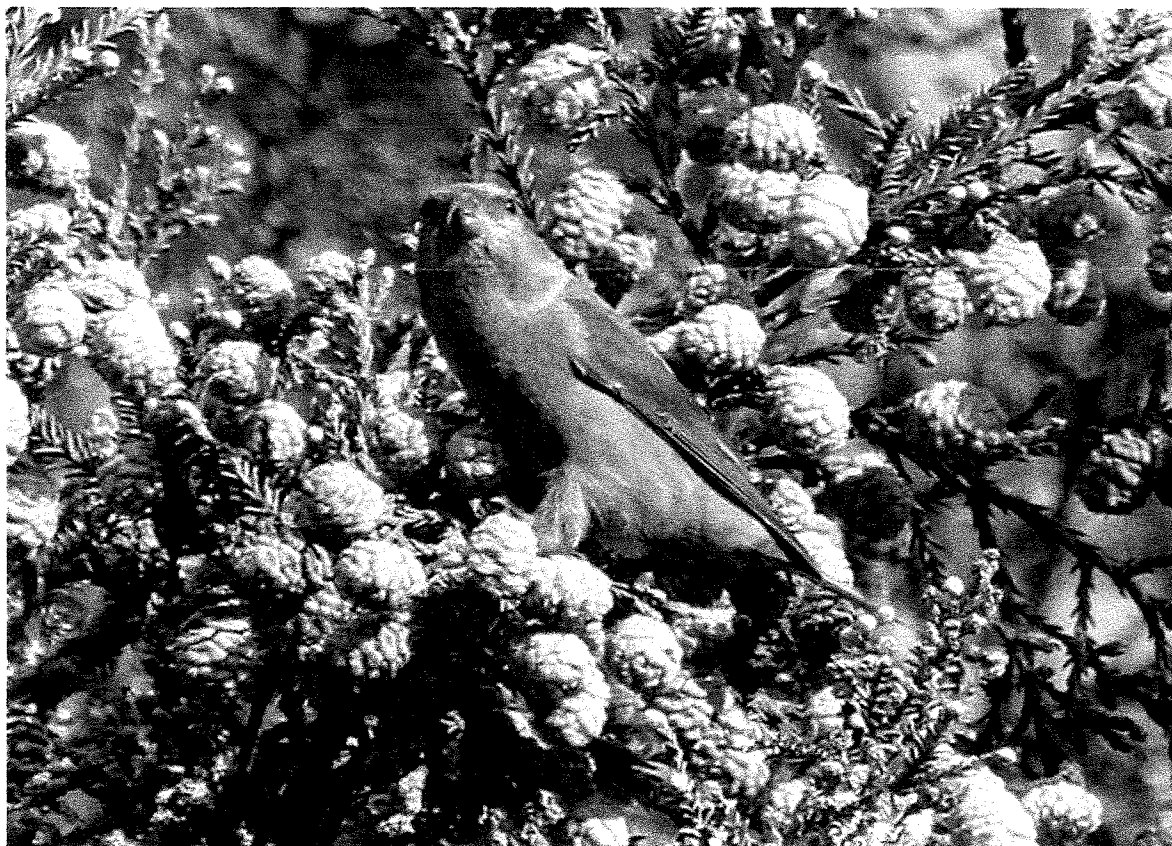
Red Crossbill, Spring Lake

RROS General Meeting, December 9, 2015 7:00 pm, First United Methodist Church 1551 Montgomery Ave., Santa Rosa, CA