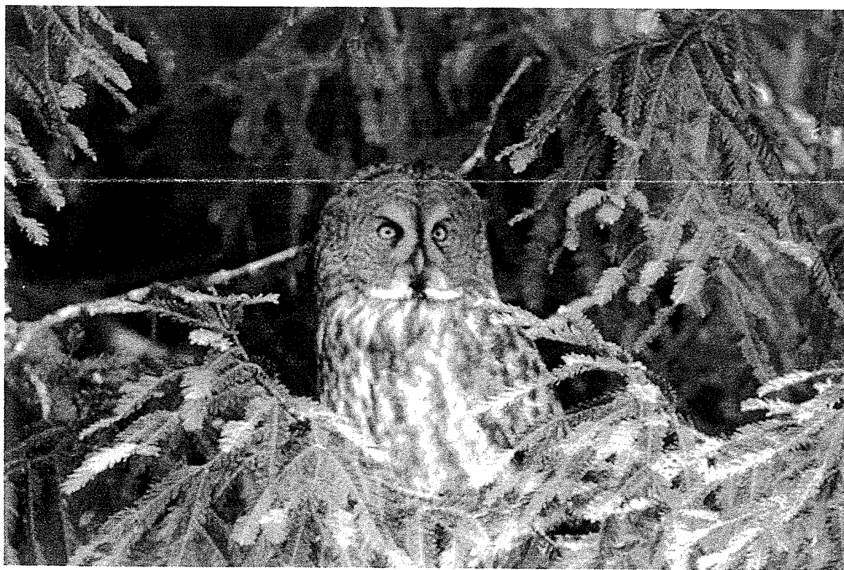
Great Gray Owl, Prairie Creek Redwoods SP

RROS General Meeting, First United Methodist Church 1551 Montgomery Ave., Santa Rosa, CA March 9, 2016, 7:00 pm