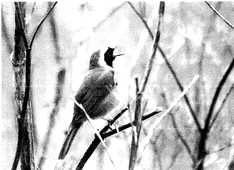
Common Yellowthroat