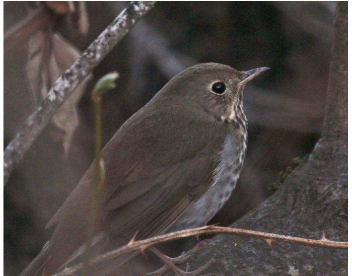
Hermit Thrush • West County Trail