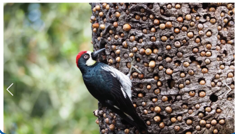
Birding is booming in Sonoma County

Familiar RROS faces talk about familiar RROS places in this recent piece from The Press Democrat.