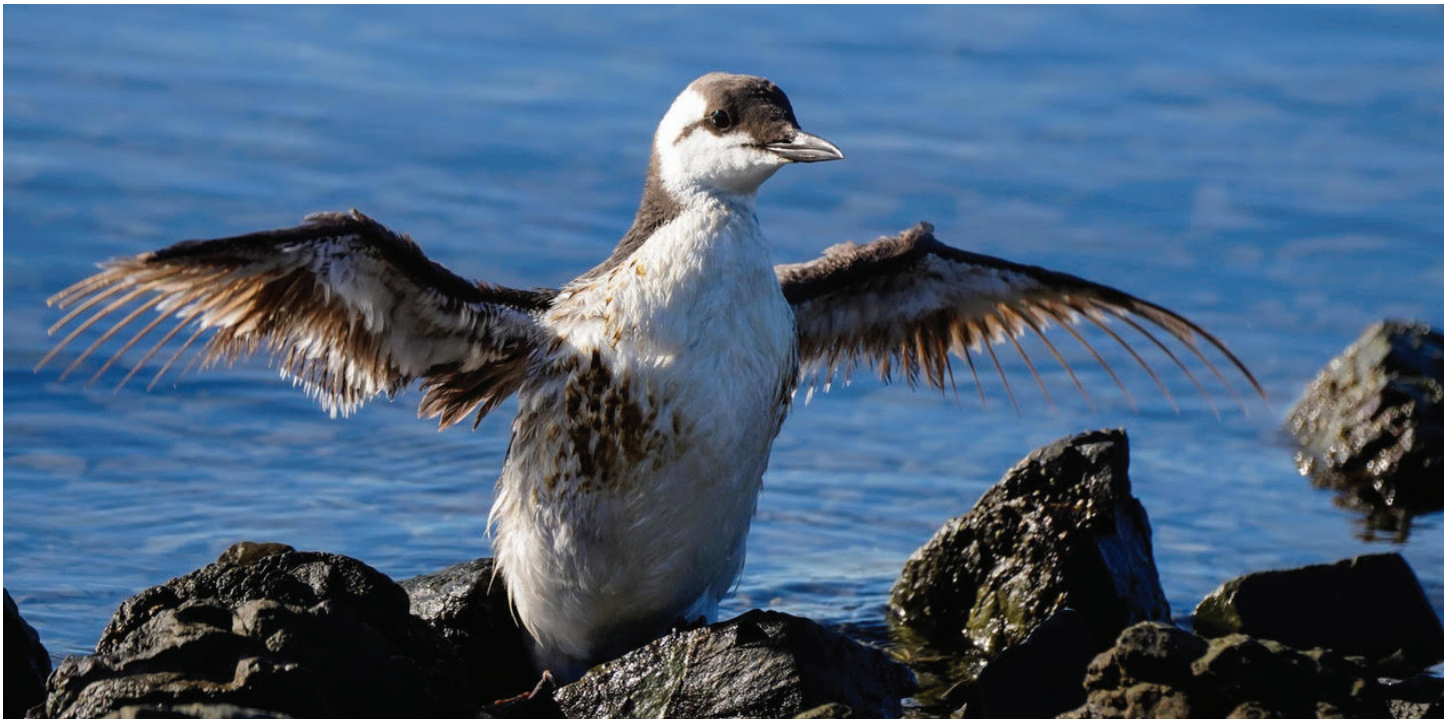
Common Murre displaying plumage in molt • Inner Bodega Bay • March 24