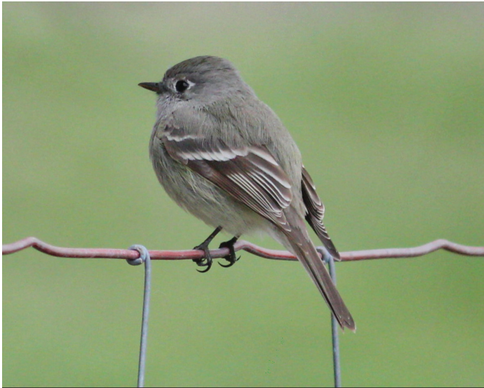
Hammond's Flycatcher • Tolay Regional Park