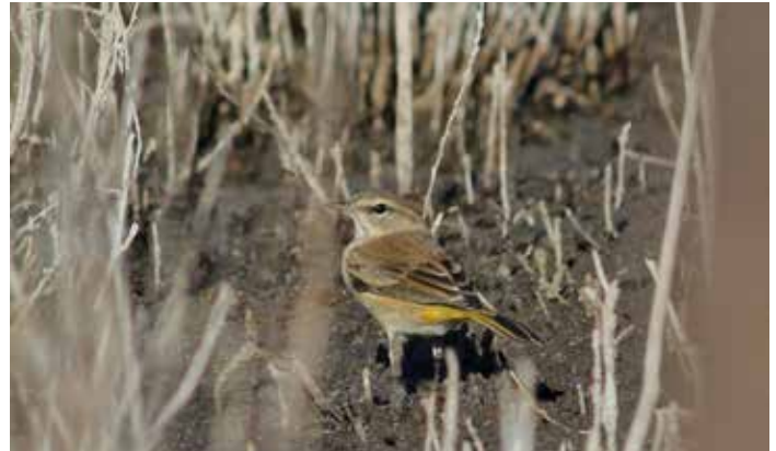
◀ Palm Warbler // Valley Ford Wetlands // Teresa Tufli