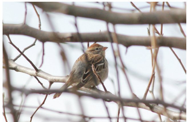
Chipping Sparrow // West County Trail, Forestville