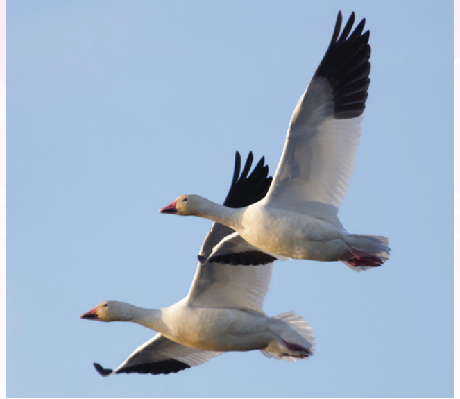
Snow Geese // Colusa NWR