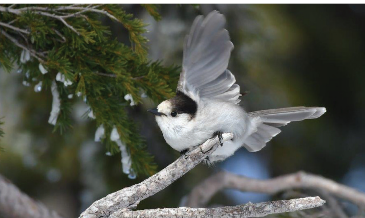
Canada Jay // Southern Oregon