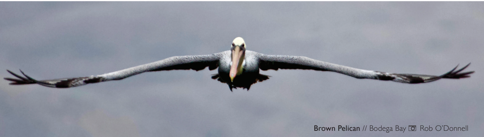
Brown Pelican // Bodega Bay