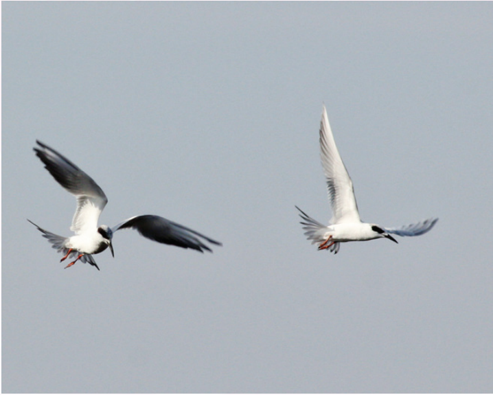
Forster's Tern // Hyw 37 , Solano County