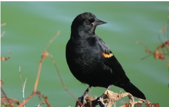
Red-winged Blackbird // Lucas Valley WTF // Aubrey Phipps