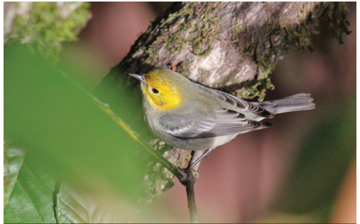
Hermit Warbler // Guernville Yard // Teresa Tufli