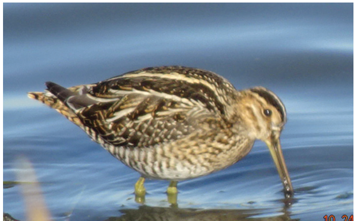
Wilson's Snipe // Lucas Valley WTF