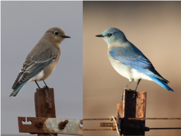
A pair of Mountain Blue Birds // Tolay RP // Malcolm Blanchard