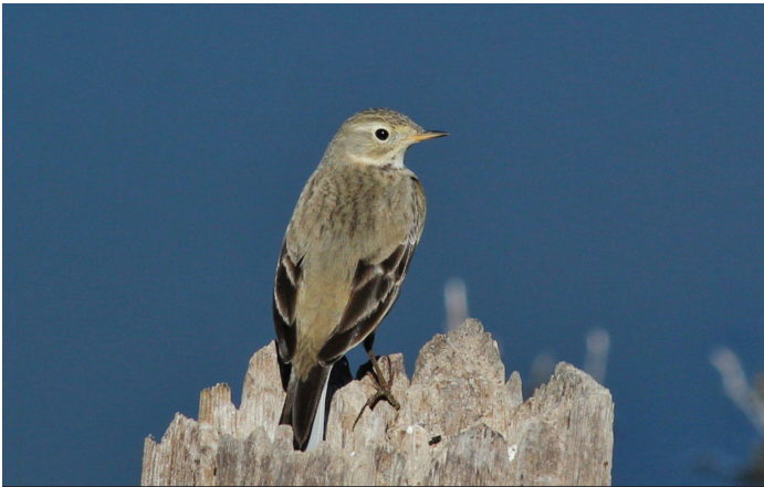
American Pipit // Valley Ford Wetlands // Teresa Tufli