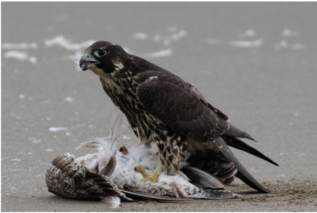
Peregrine Falcon dining on (an assumed) Mew Gull // Doran Regional Park