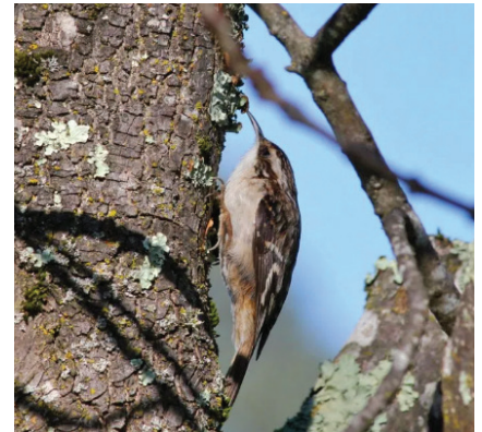
The American Kestrel and Dark morph Red-tailed Hawk were both seen in Section 11, while the Brown Creeper was in Sec. 4