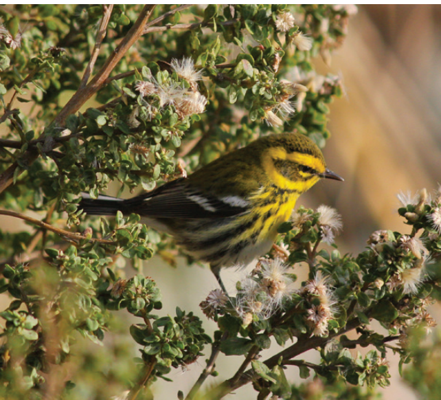
Townsend's Warbler // Tide's Wharf, Bodega Bay // By Teresa Tuffli