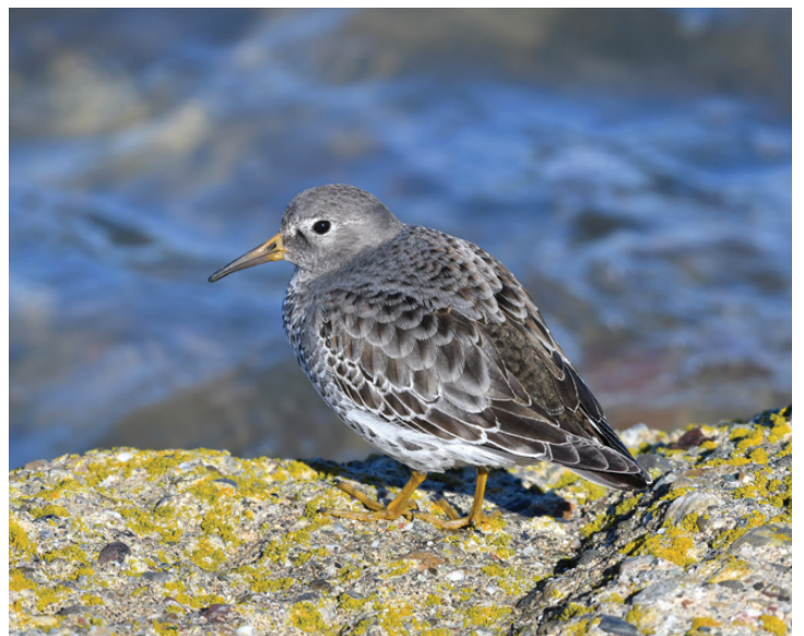
Rock Sandpiper // San Francisco