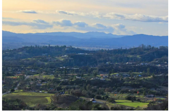
A panoramic view from Foothill Ranch Road (Section 4)