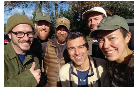
One of the tenants of any CBC is solid teamwork and camaraderie and Santa Rosa CBC had plenty of both. From the trails and roads to the compilation dinner, a monumental task was achieved with the vigor and dedication from our community of birders.