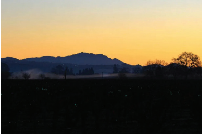
Rise and shine as Santa Rosa CBC'ers were up with the chilly winter sun! As we all know, the early bird(er) gets the birds!