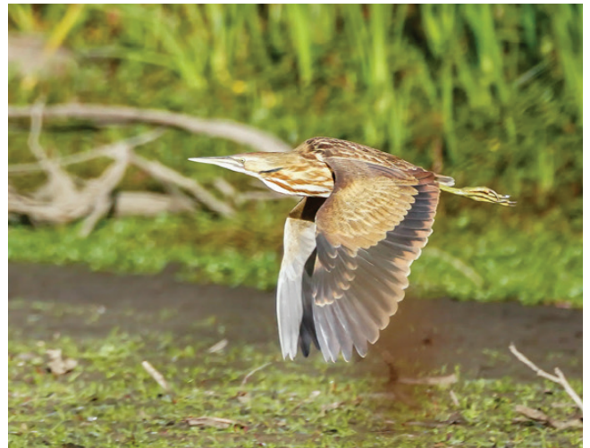
American Bittern // Spring Lake, Santa Rosa