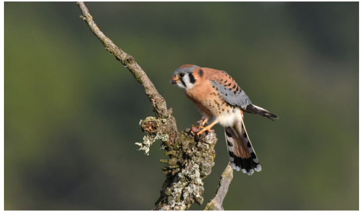
American Kestrel // Section II, Santa Rosa CBC