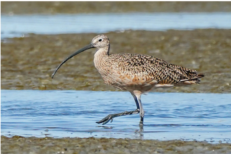
Long-billed Curlew // Baylands, Palo Alto