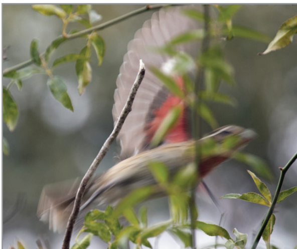
A diagnostic flash of red on a Rose-breasted Grosbeak // Private Residence, Rohnert Park // By Malcolm Blanchard