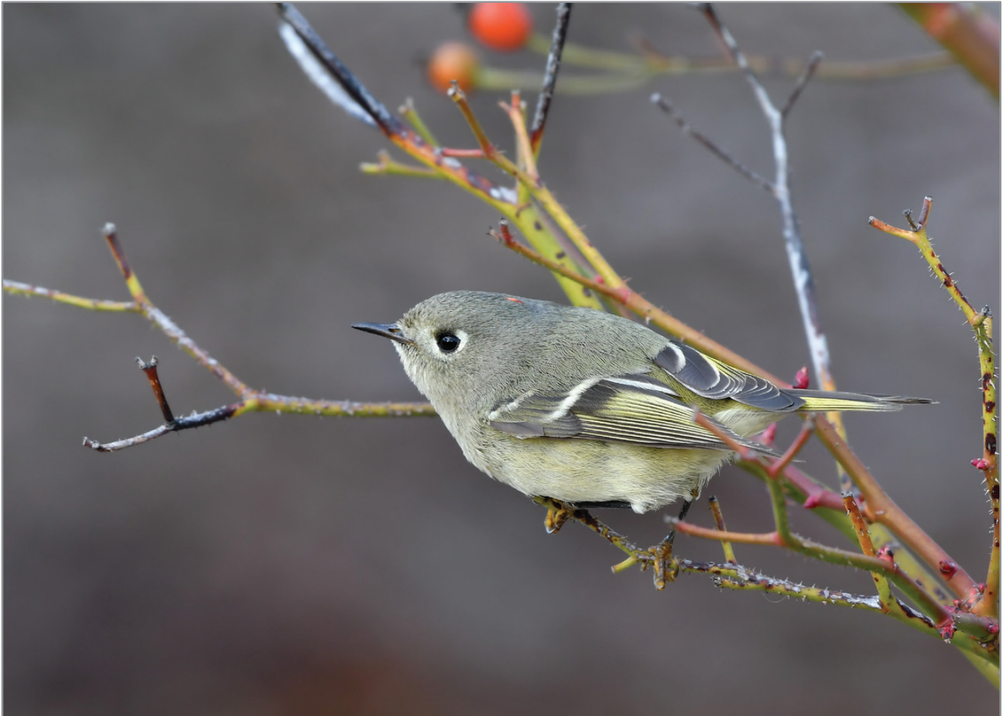
Ruby-crowned Kinglet